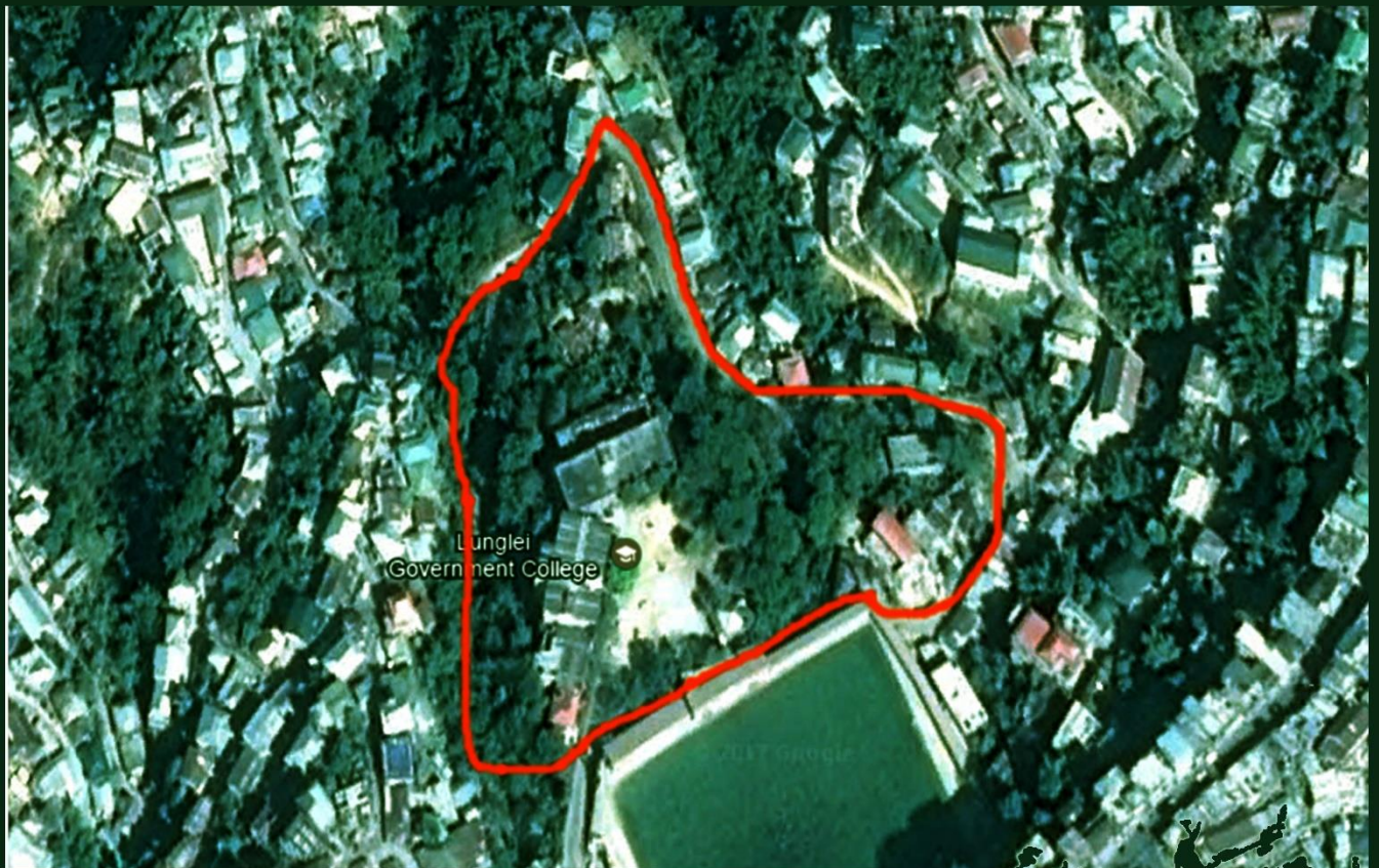
Map of Lunglei Govt. College. Lunglei. Mizoram